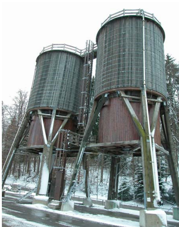
Road salt silo system in Herisau (Outer Appenzell)

Depending on the requirements of the system, the following alternatives are available: